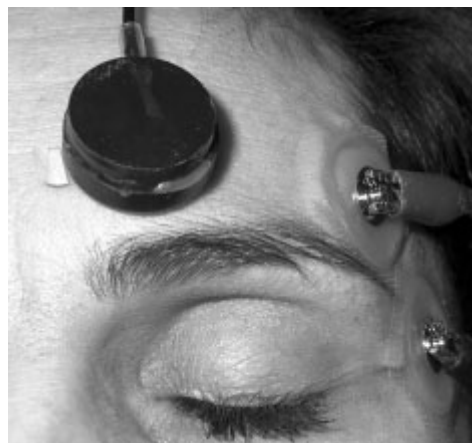
FIGURE 3: A small piezoelectric microphone is attached with self-adhesive tape onto the skin overlying the corrugator supercillii muscle. Nerve stimulation is performed in routine fashion using AgCl-electrodes.

This method has been developed in the author's department at the University of Montreal