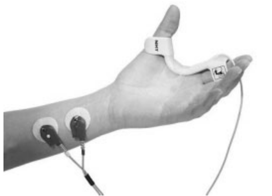
FIGURE 2: NMT-mechanosensor: a flexible plastic device is applied to the thumb to mimic a MMG-like preload. Recording displays columns and percentages of control amplitude.

monitoring device on the market to objectively measure NMB during routine clinical procedures.